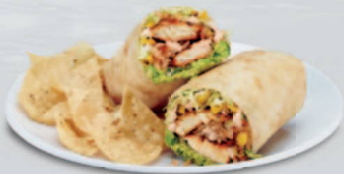
Blackened Tilapia Burrito

Sustainable seafood is fished or farmed in a way that maintains or increases seafood populations without harming the environment.