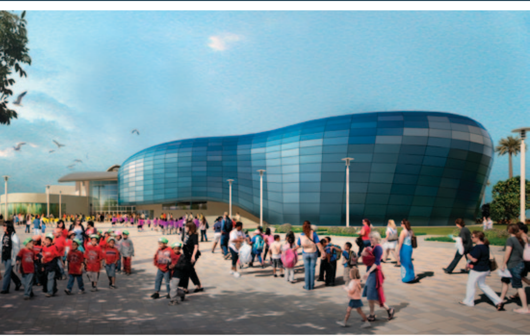
Rendering of new Pacific Visions wing

THE PACIFIC VISIONS CAMPAIGN IS UNDERWAY. It will create the most powerful educational platform for communicating the challenges and opportunities of the World Ocean.